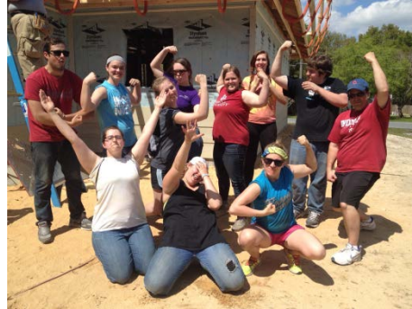
The whole group doing our victory pose at the end of the week!