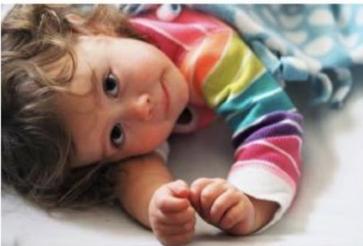
Nap time at The Nest

The homeless families in our community are especially vulnerable during this global pandemic. Your donations to New Hope for Families are making a difference! To donate items for their immediate needs, please refer to the list provided each week in the St. Thomas Weekly. Alternatively, a monetary contribution can be mailed to St. Thomas with "New Hope for Families" in the memo line. Grateful for the generosity and compassion of this congregation!