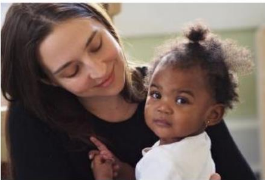
Cuddle time at The Nest